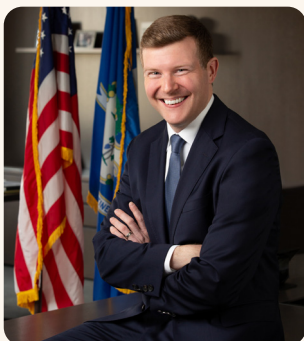
»» Sean Scanlon State Comptroller @CTComptroller