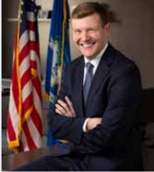
Sean Scanlon State Comptroller